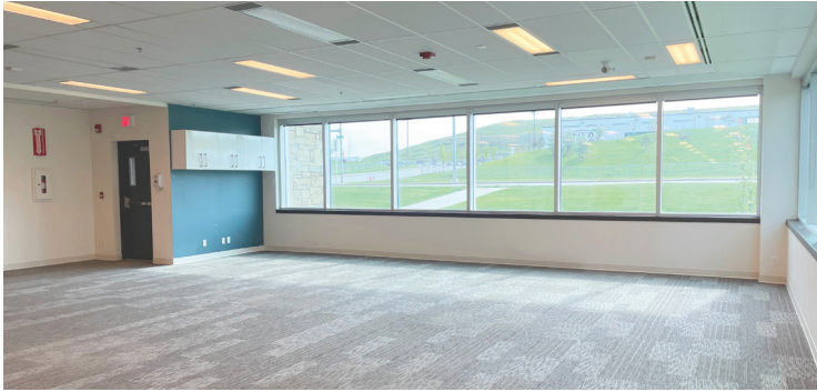
Main floor – west facing boardroom