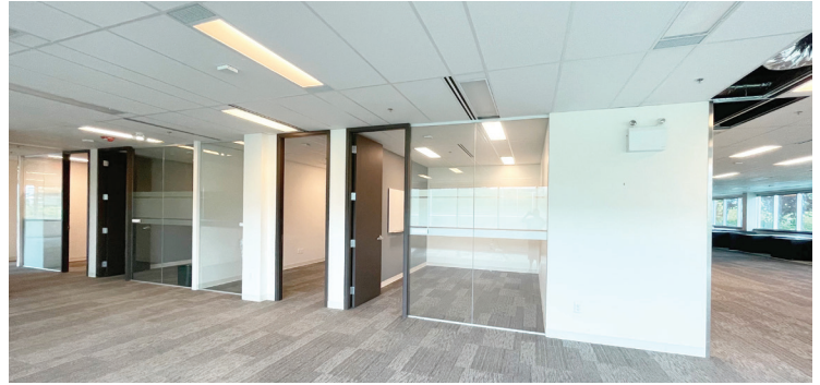
Main floor – common lobby, currently undergoing further upgrades

Built-out offices with an abundance of natural light