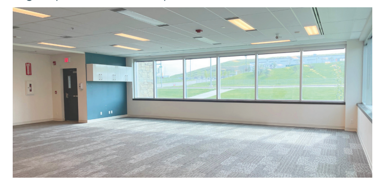
Main floor – west facing boardroom