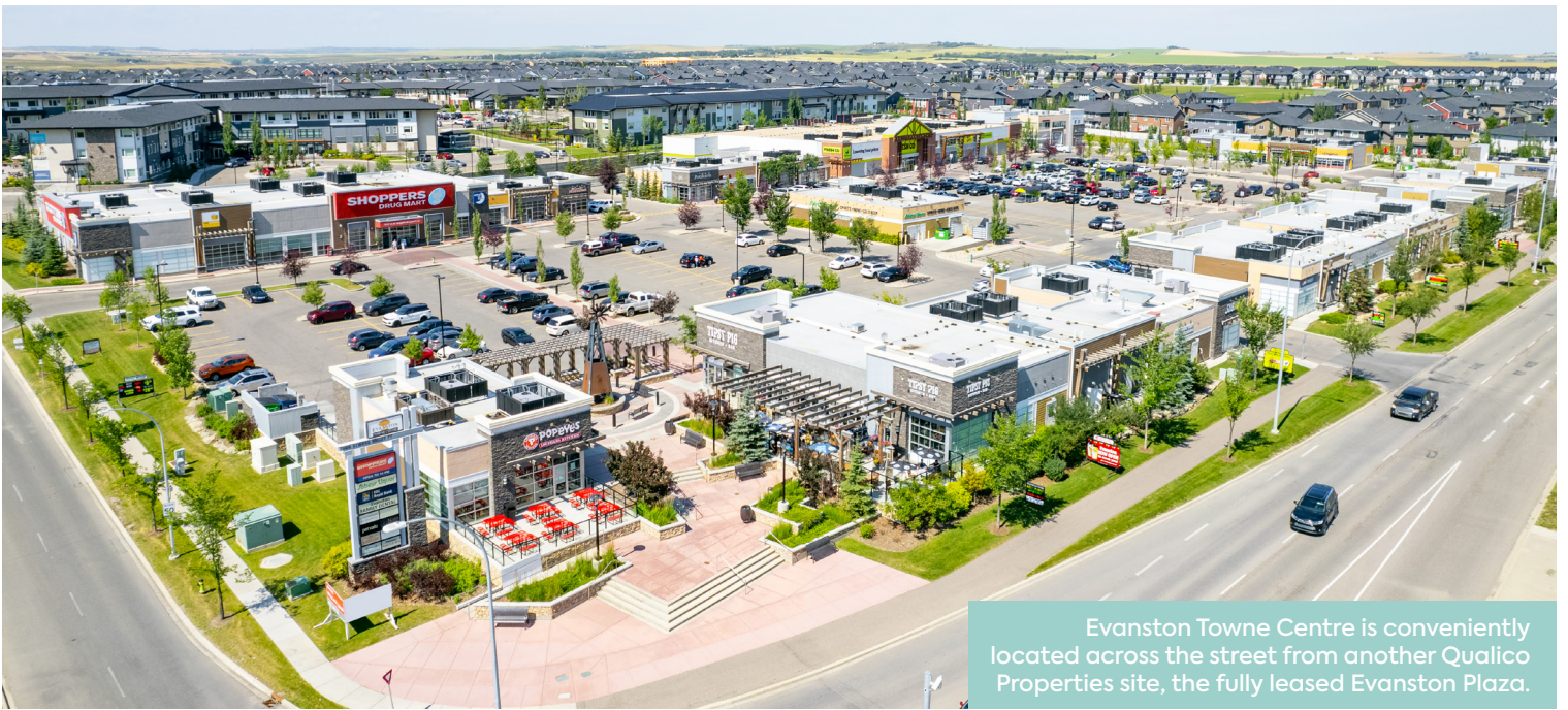
Evanston Towne Centre is conveniently located across the street from another Qualico Properties site, the fully leased Evanston Plaza.