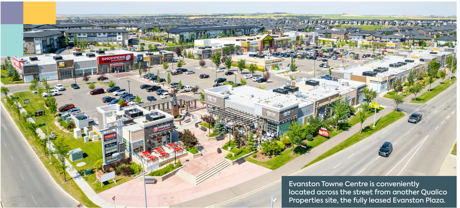
Evanston Towne Centre is conveniently located across the street from another Qualico Properties site, the fully leased Evanston Plaza.