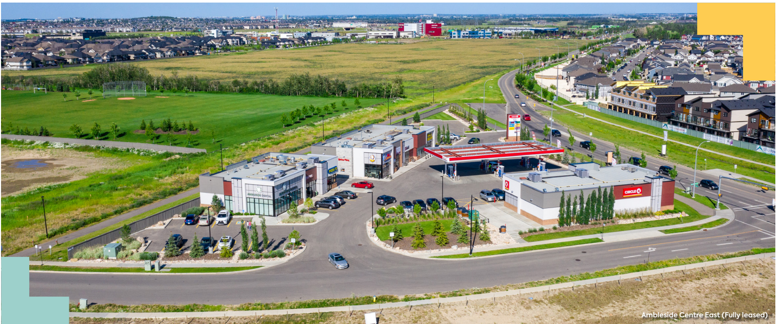
Ambleside Centre East (Fully leased)